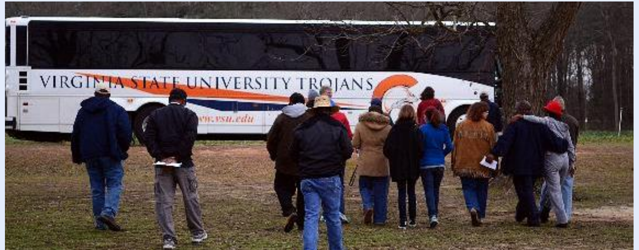
Annual Conference and Agribusiness Bus Tour