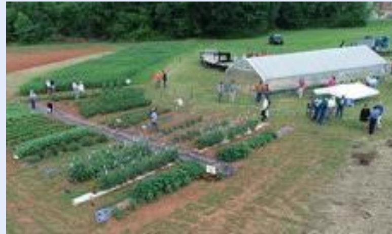
SFOP Small Farm Program Assistants demonstrating to small farmers