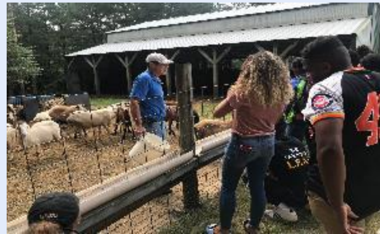
Providing hands-on experience