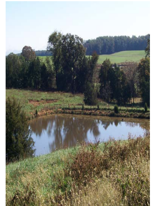
A Typical Earthen Pond at Cedar Springs Dairy in Madison.