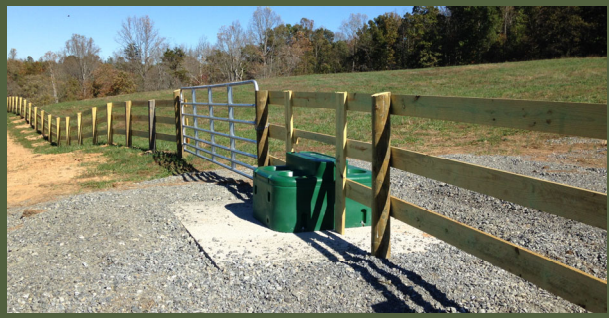
Interior Fencing & Water System