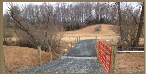
Stream Crossing – Ramp Style