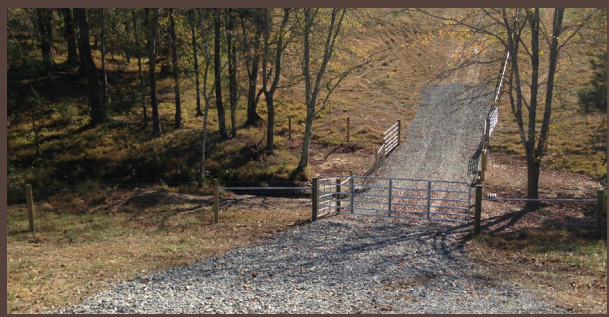
Stream Crossing – Culvert